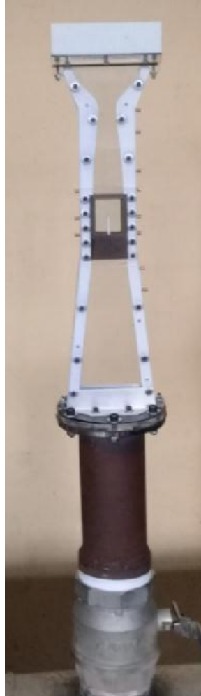
Figure 1. Supersonic tunnel.